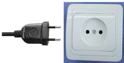
European (2-pin) plug/socket